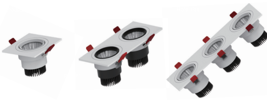
one light two lights three lights